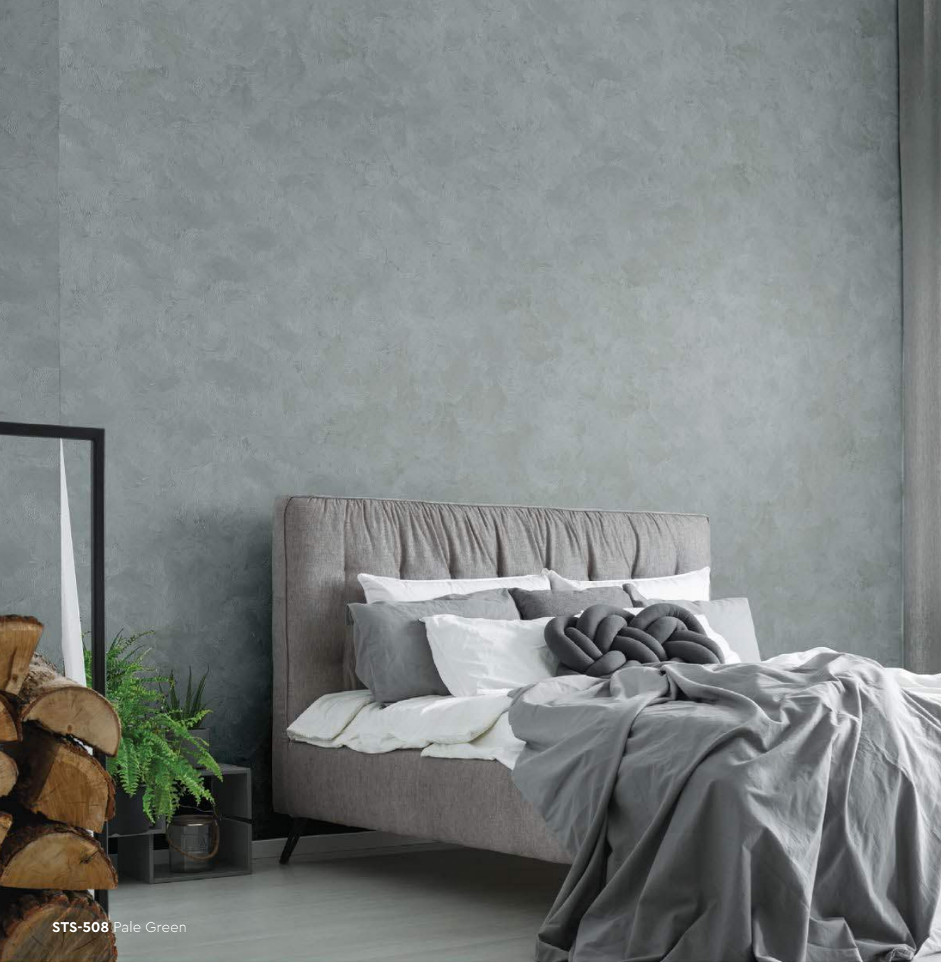
STS-508 Pale Green