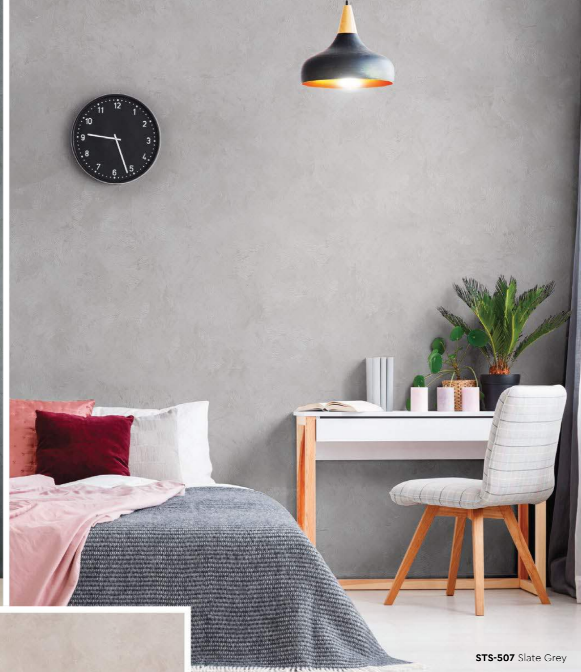
STS-507 Slate Grey