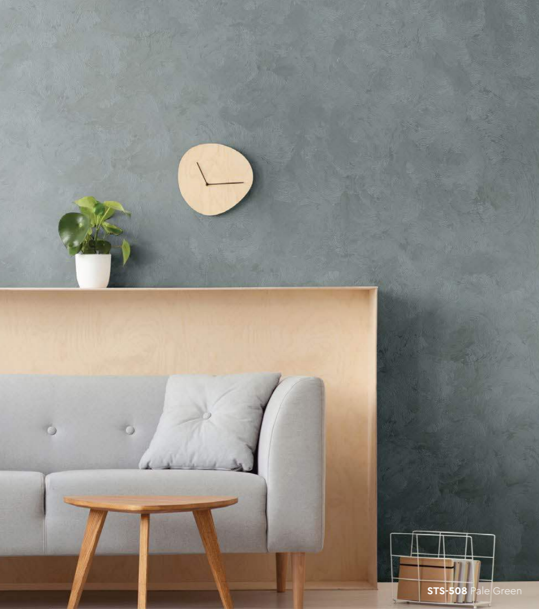
STS-508 Pale Green