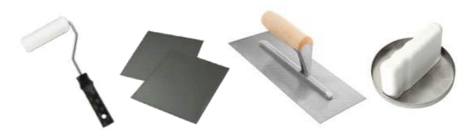
Tools: Roller, Sand Paper (600 Grit) Trowel & Piccolo Tool

IMPORTANT: Color may vary on application technique & amount of material used. Dilution Guide: Primer : Max 3% of clean water. Texture : Do not dilute.