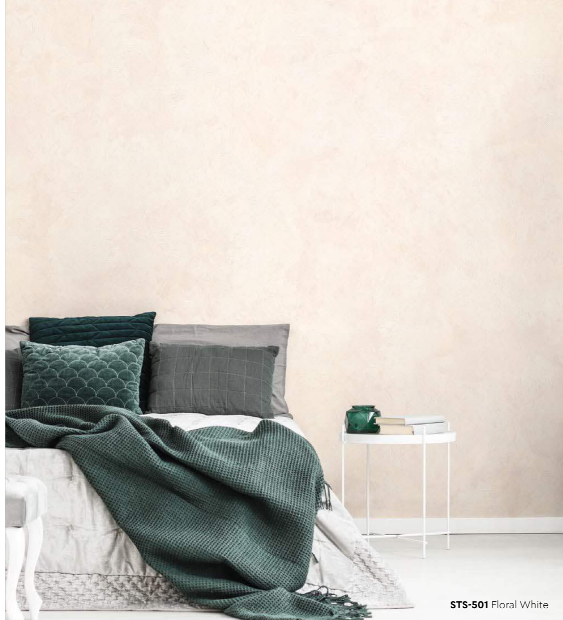
STS-501 Floral White