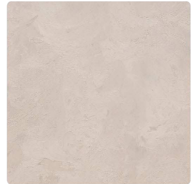
STS-505 Milky Latte