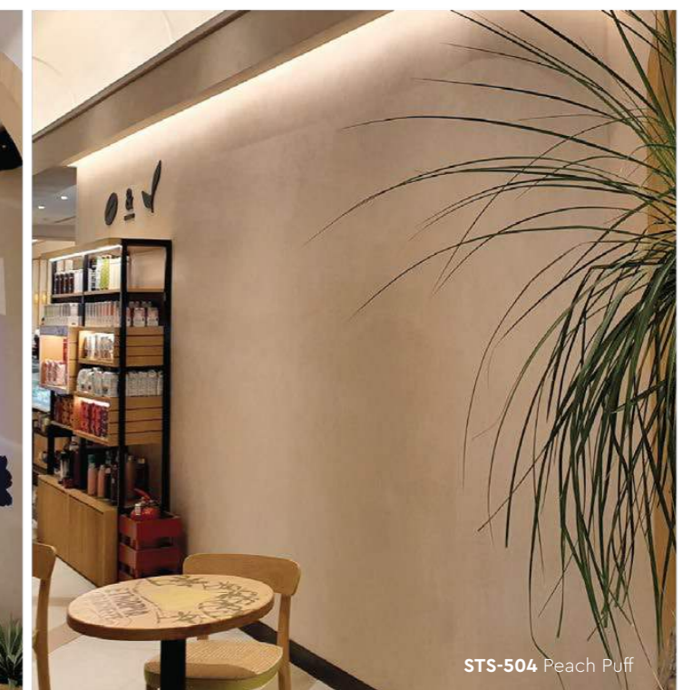
STS-504 Peach Puff