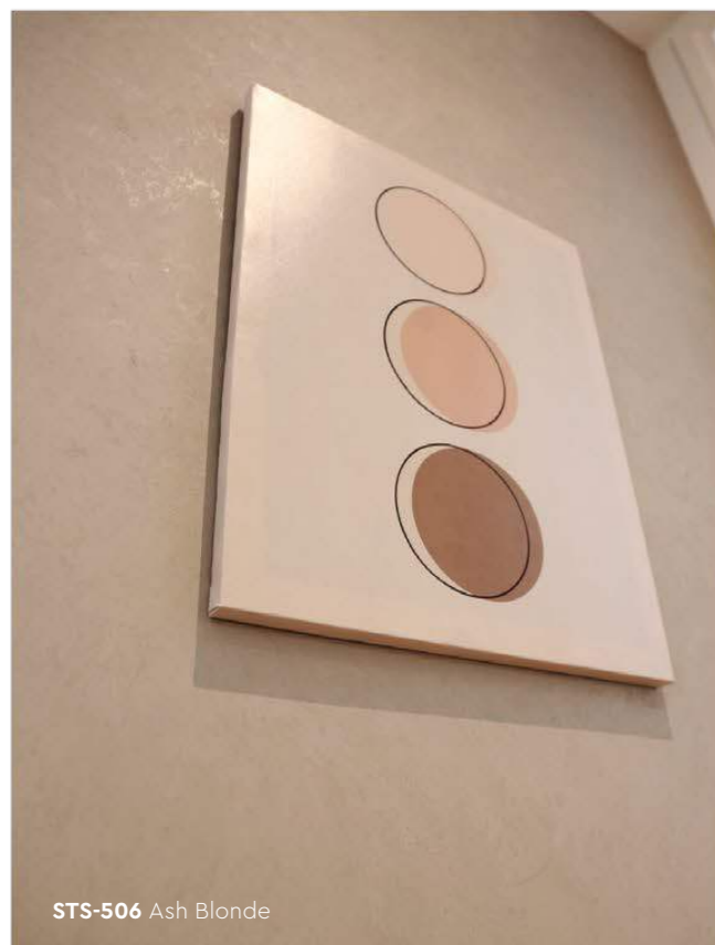
STS-506 Ash Blonde