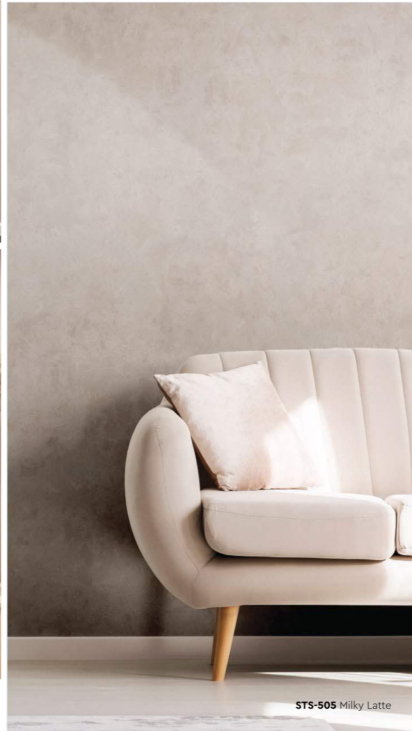
STS-505 Milky Latte