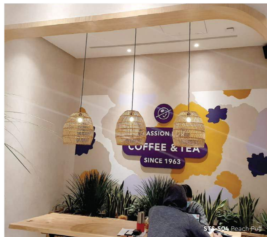
STS-504 Peach Puff

We highly recommend seeing actual samples before ordering.