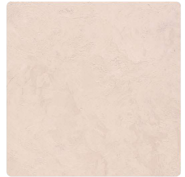
STS-504 Peach Puff

We highly recommend seeing actual samples before ordering.