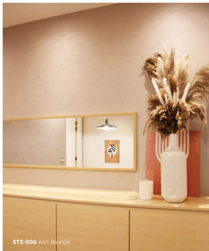
STS-506 Ash Blonde