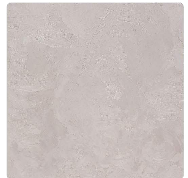
STS-506 Ash Blonde