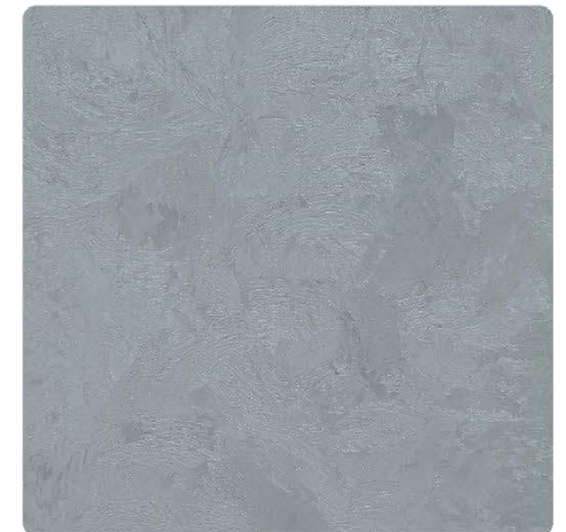
STS-508 Pale Green