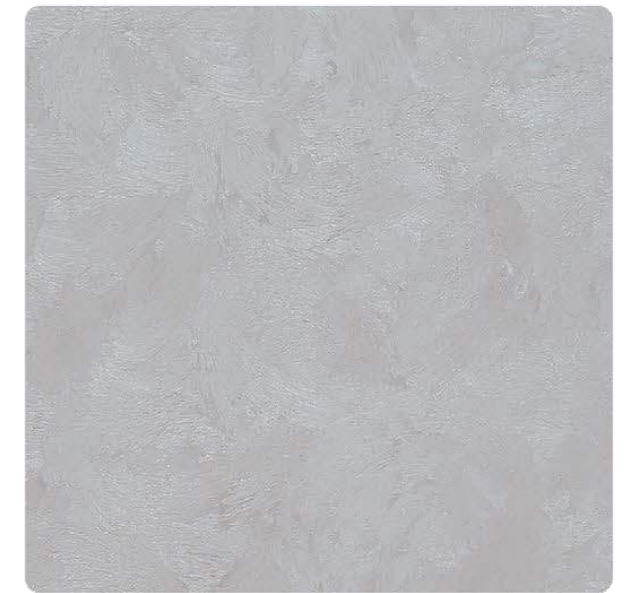
STS-507 Slate Grey