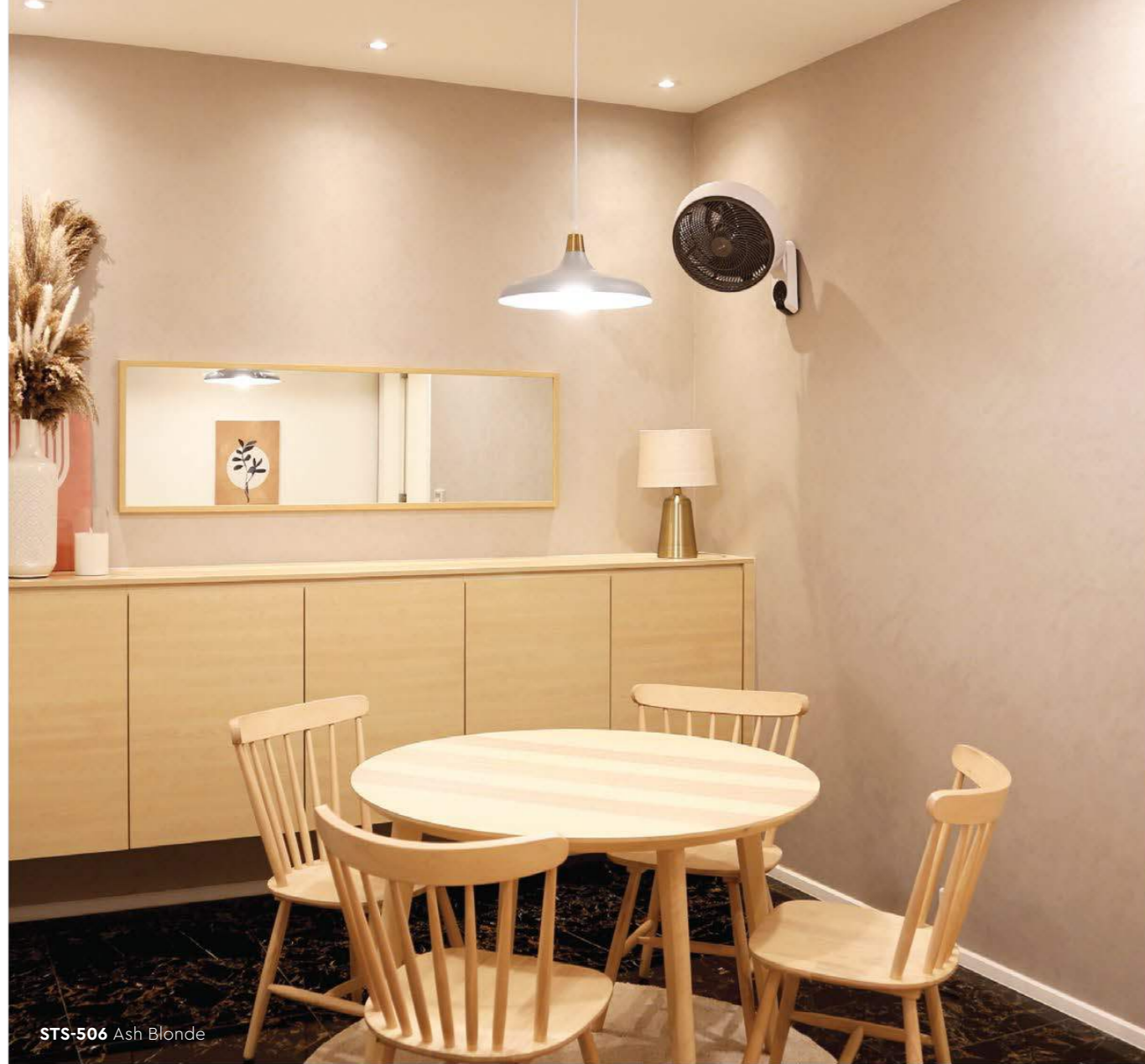
STS-506 Ash Blonde

All color shown are as close to the actual Suzuka® Strato® colors as modern printing techniques permit, nonetheless, there are still color/tone differences.