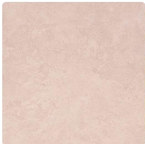
STS-503 Misty Rose